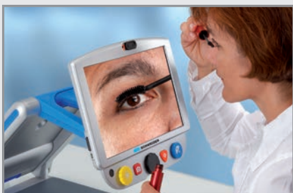
Front camera for self-viewing

Magnification: 1.7x to 24x 1.0x to 2.5x (self-view camera) Weight: 4.3 kg – with battery 3.8 kg – without battery Dimensions (W x D x H): approx. 31.7 x 34.3 x 6.1 cm Screen size: 12 inch (30 cm) with 4-metre power cord and carrying case