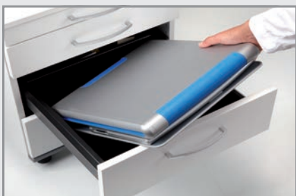
Small and handy to store away