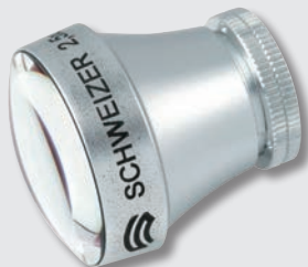
937255 2.5x Field of view 18°; 20 g