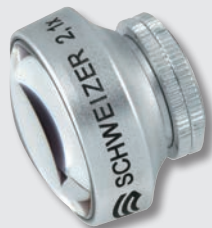
937215 2.1x Field of view 20°; 18 g