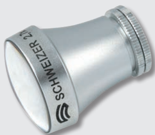
937275 2.7x Field of view 13°; 30 g