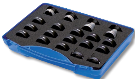
931067 Trial box Galilei 2.1x and 2.5x

Contents: 2 pieces of 1.8x in adapter for trial frame; 2 Basic front caps in +0.5 D; 1 titanium telescope frame 935806; measuring tape; empty slots for additional Basic and Add-on front caps