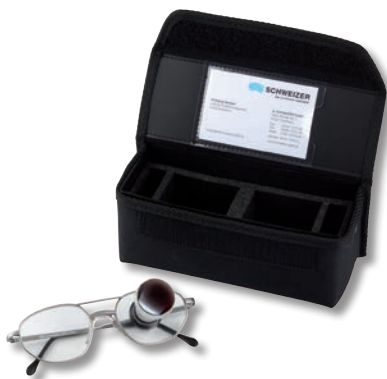
937116 Case for telescopic spectacles