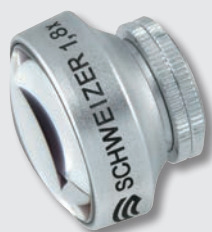
937185 1.8x Field of view 23°; 13 g