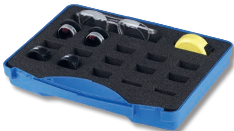
931287 Trial box Galilei 1.8x

Contents: 2 pieces of 1.8x in adapter for trial frame; 2 Basic front caps in +0.5 D; 1 titanium telescope frame 935806; measuring tape; empty slots for additional Basic and Add-on front caps