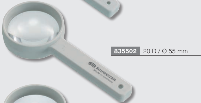
835502 20 D / Ø 55 mm