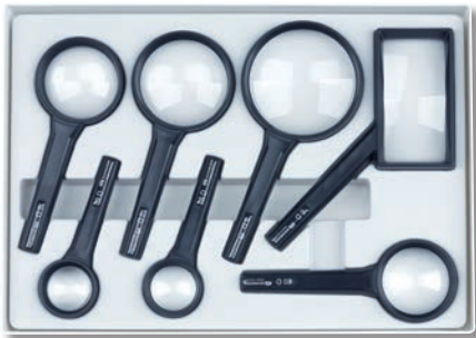
214002 Box SEMPRAL

Contents: 39 D, 28 D, 20 D, 16 D, 12 D, 8 D, 6 D