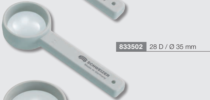
833502 28 D / Ø 35 mm