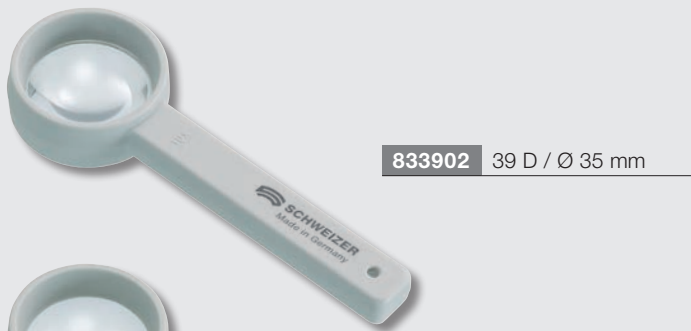
833902 39 D / Ø 35 mm