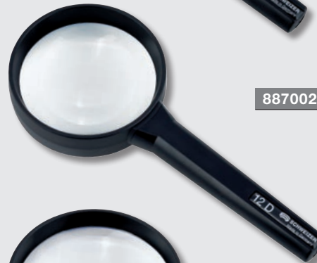
887002 12 D / Ø 70 mm