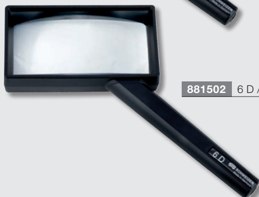
881502 6 D / 100x50 mm