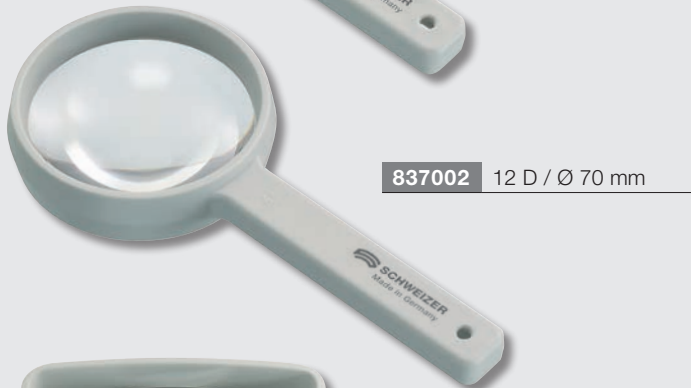
837002 12 D / Ø 70 mm