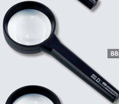
885502 20 D / Ø 55 mm