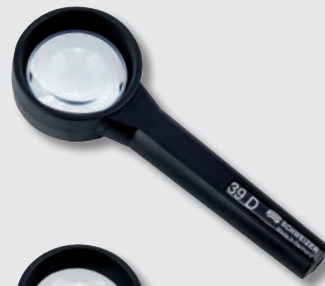
883902 39 D / Ø 35 mm