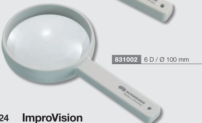
831002 6 D / Ø 100 mm