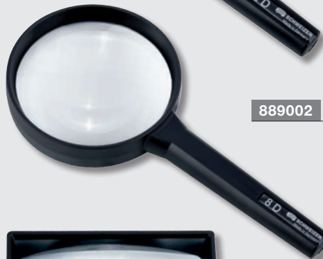
889002 8 D / Ø 85 mm