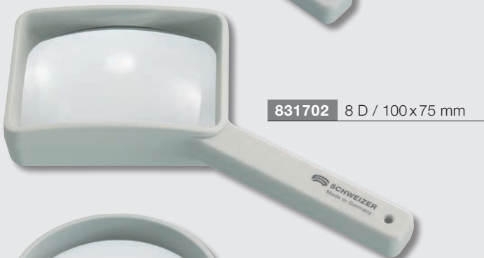
831702 8 D / 100x75 mm