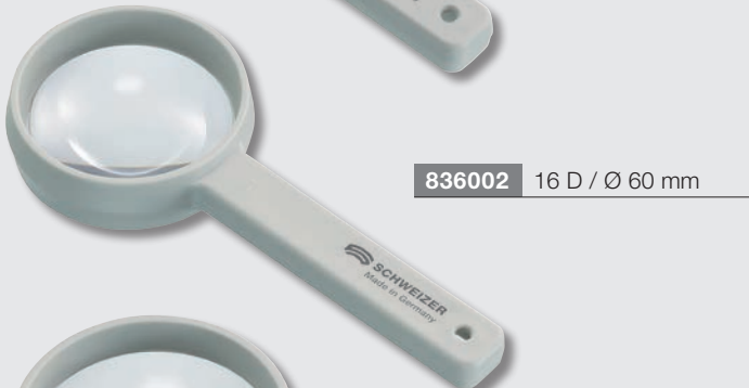
836002 16 D / Ø 60 mm