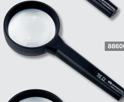
886002 16 D / Ø 60 mm