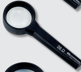
883502 28 D / Ø 35 mm